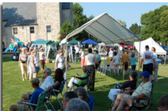
Cake walk at Schwarzwald Lutheran Church Picnic

Of course, I couldn't explain cakewalks without explaining the Ringgold Band. I have only experienced cakewalks in the context of church picnics where they are accompanied by the Ringgold Band's treasure trove of cherished marches. This tradition is an integral part of the Ringgold Band's summer line-up. The season would simply not be complete if audience